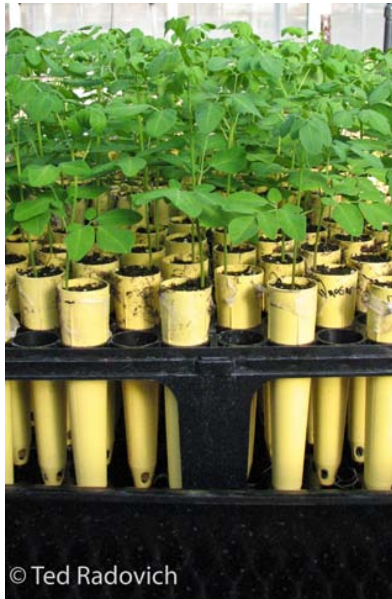
Nursery grown moringa seedlings.

Spacing for leaf production is 0.75 m (30 in) within rows and 1 m (3.3 ft) between rows. For pod production, recommended spacing is 2.5 m × 2.5 m (8.2 ft × 8.2 ft). Fertilizer and irrigation are recommended for maximum productivity. Addition of 300 g (10.5 oz) of complete fertilizer or 0.5–2 kg (1.1–4.4 lb) of manure per tree is recommended at planting. Positive yield response has been reported at N fertilization rates as high as 350 kg N per ha (312 lb N/ac). Trees have been reported to benefit from integrated (organic + synthetic) fertilization. Seedlings should be pinched at 1 m (3.3 ft) tall or 2 months after planting to stimulate side branching. Irrigation should be supplied during dry periods to maxi-