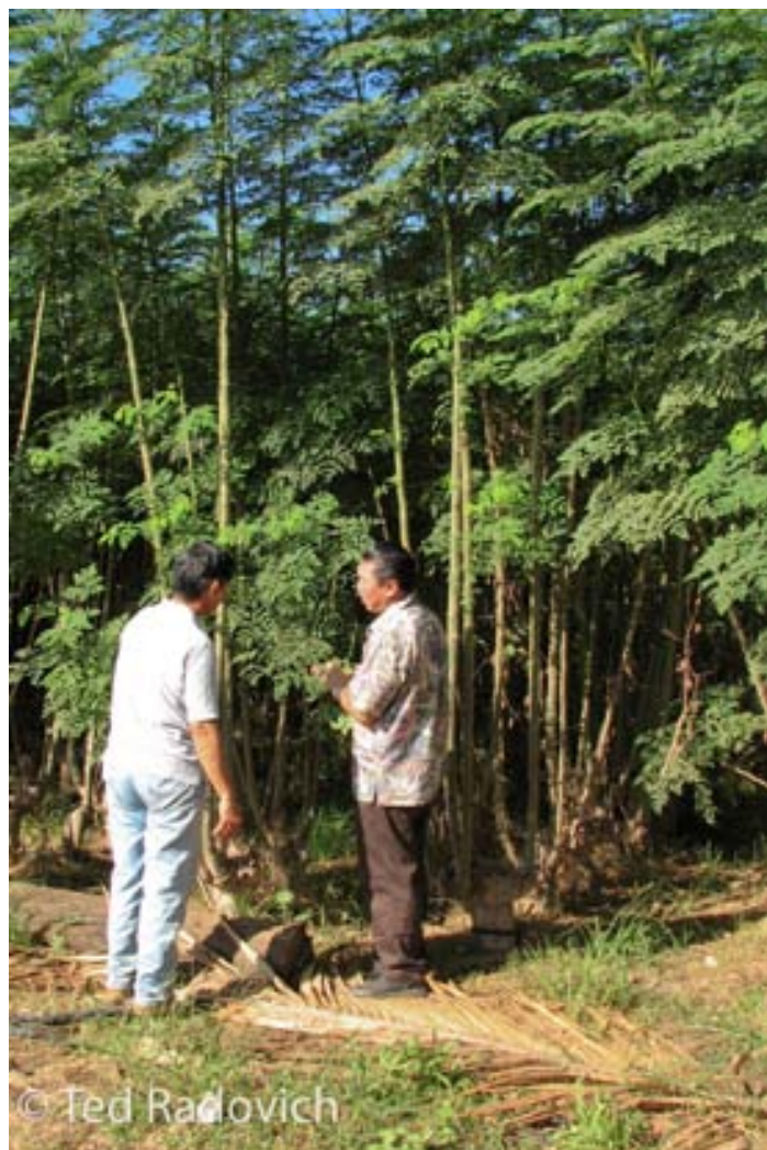
Left: Very young pods contain little fiber and can be cooked like string beans. Right: Commercial production of moringa leaf in Kūnia, O'ahu, primarily for export to the U.S. mainland (West Coast) and Canada.