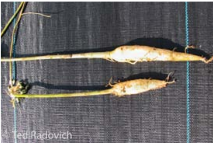
Top: Moringa trees growing as living fence posts with barbed wire strung between them. Bottom: Large taproot of moringa seedlings (approx. 3 months old).

If direct-seeding is not used, 1–2 month old seedlings (about 30 cm [12 in] tall, 0.75 cm [0.3 in] in diameter) or well rooted cuttings are transplanted into well cultivated soil. The size of transplants generated by cuttings is not important, but the root system should be well developed. If grown in heavy soils, raised beds may be used to improve drainage.