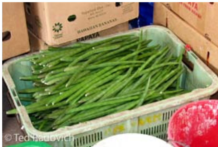
Immature pods harvested for market.

Low-tech oil expellers have been successfully used for extracting moringa oil. One such press (the "Komet press") is reported to produce 6.5 liters (7.2 qt) in 8 hours, with a 12% yield of oil. The same report said that 10 kg (22 lb) of seed yielded 1.2 kg (2.64 lb), or 1.3L (1.4 qt) of oil. Ram and screw presses have also been used for moringa oil extraction, with yields of 5–6%. Dehulling can improve oil yield, but the increase is small and may not justify the extra effort (Mbeza et al. 2002). Yields using a screw press can be improved to 20% if the seed is first crushed, 10% by volume of water is added, followed by gentle heating over low heat for 10–15 minutes, taking care not to burn the seed (Folkard and Sutherland 2005).