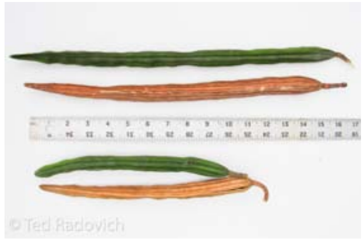
Left: Moringa variety trials, Poamoho, O'ahu. Right: Mature green and dry pods from short- and long-fruited varieties of moringa.

mize vegetative growth. Subsequent fertilizer applications after coppicing are also recommended.