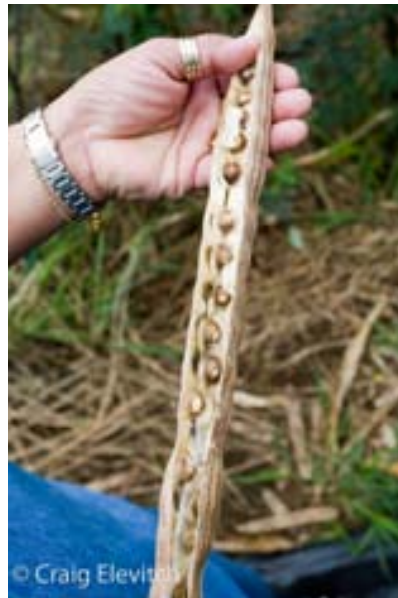
Left: Moringa flowers. Right: dried, mature pod broken open to expose seeds.

drought and poor soils, and responds well to irrigation and fertilization.