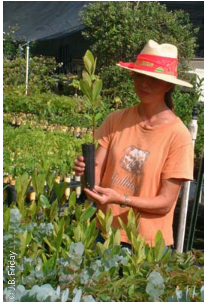
Top left: Seeds are sown into seedbeds for germination. Bottom left: Wildlings may often be found growing under existing groves. Right: Large seedlings require relatively large containers.

large containers about 25–36 cm (10–14 in) deep and over 6 cm (2.4 in) in diameter. Good nursery practices should be followed, including the use of soil-less potting media to reduce diseases and forestry-specific containers to train root development. Seeds are usually collected locally as they fall. Seeds are recalcitrant; they may be stored for a few months if kept cool and dry but not longer. There are 100–200 fruits/kg (45–90/lb) and fresh seeds may have a 90% germination rate. Before planting, ripe fruit (with yellow or wrinkled brown skin) may be cleaned by soaking overnight and cleaning off the skin and husks. Germination is improved if the shells are cracked with pliers or a mallet just before sowing (Wilkinson and Elevitch 2004). In one study, germination averaged 3 weeks for fully shelled seeds but 5 weeks for seeds with cracked shells and 8 weeks for unshelled fruit (Parras, no date).