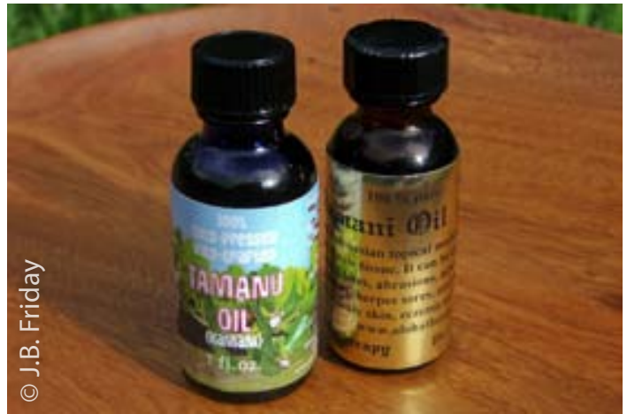
Bottles of tamanu (or kamani) oil for sale in Hawai'i.

The value of tamanu oil lies not just in its physical and healing properties, but with the connection consumers make with the Pacific islands. For Western users, it allows an escape from the daily routine and the chance to try something exotic. For consumers in Hawai'i or Polynesia, using tamanu oil allows them to connect with a cultural tradition. Tamanu oil is seen as a treat or an indulgence rather than something for everyday use. As currently sold, the oil is packaged in very small bottles, usually only 30 ml (1 oz) and seldom more than 60 ml (2 oz) with labels evoking Hawai'i or the South Pacific. For the Hawai'i market (or for marketing to those who have visited Hawai'i) the oil is labeled "kamani oil" using the Hawaiian name but for the rest of the world it is more commonly labeled "tamanu oil" using the Tahitian name. Although the oil is now also sourced from Madagascar, the marketing emphasizes the connection with Tahiti or Hawai'i rather than Africa. Value is added to the product not so much by processing as by packaging and marketing. Some oil is marketed as being USDA certified organic, although it is unlikely that pesticides or chemical fertilizers are used to any great extent for tamanu. Tamanu wood is likewise prized in Hawai'i, Tahiti, and elsewhere in