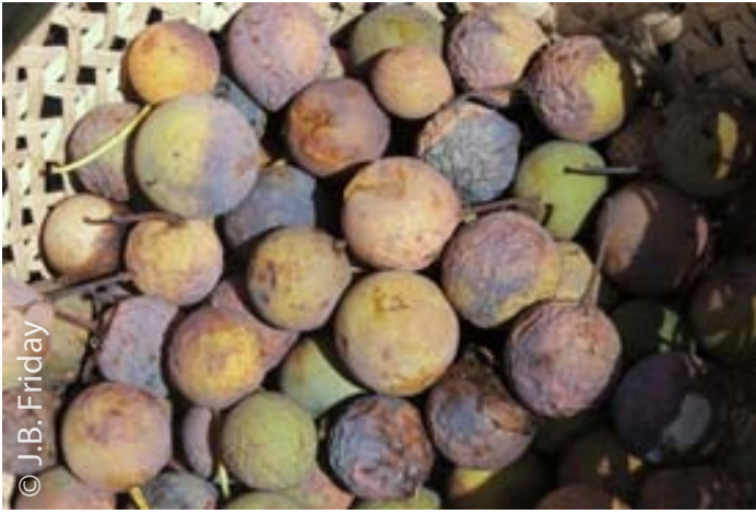
Ripe tamanu fruits in a basket.

(2005) calculated oil yield to be 4,680 kg/ha (4,175 lb/acre), under the assumptions that 400 trees are planted per hectare and each tree produces 11.7 kg of oil. Kukui, a tree similar in size to tamanu, would be planted at a population density of 198 trees/ha (80 trees/acre) (Wilcox and Thompson 1913). If the kukui population density were used for tamanu, the calculated oil yield would be 2,317 kg/ha, not far from the 2,000 kg/ha reported by Srivastava (1985).