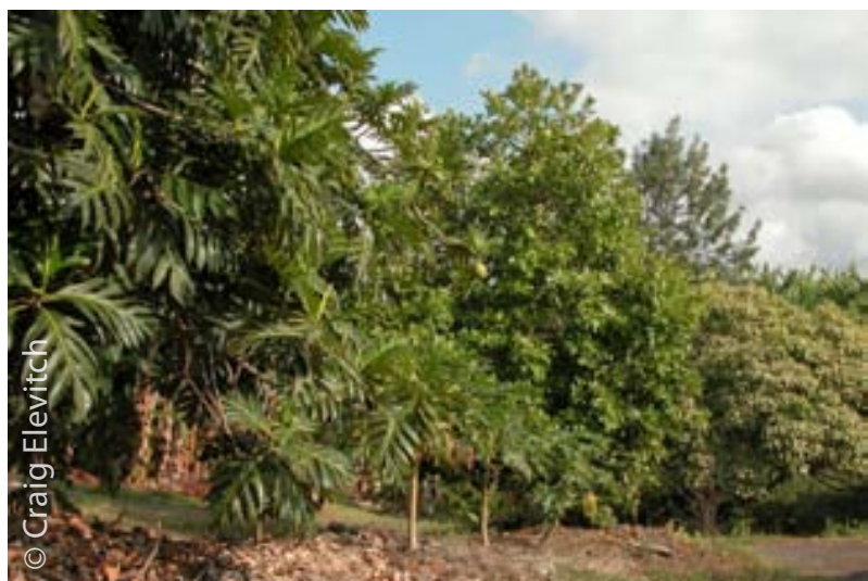
Top: Tamanu trees shade Marine Drive in Guam. Bottom: Tamanu tree (at center of photograph) grows together with breadfruit ( Artocarpus altilis ), papaya ( Carica papaya ) and kukui ( Aleurites moluccana ) at 460 m (1,500 ft) elevation in Kona, Hawai'i.