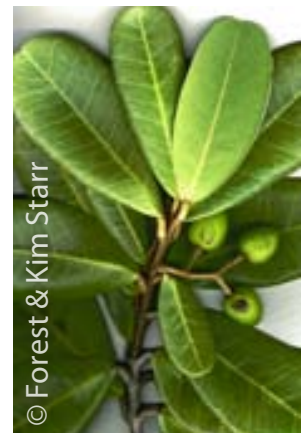
Coastal species autograph tree (left), Indian almond (middle), and Madagascar olive (right) can be confused with tamanu.