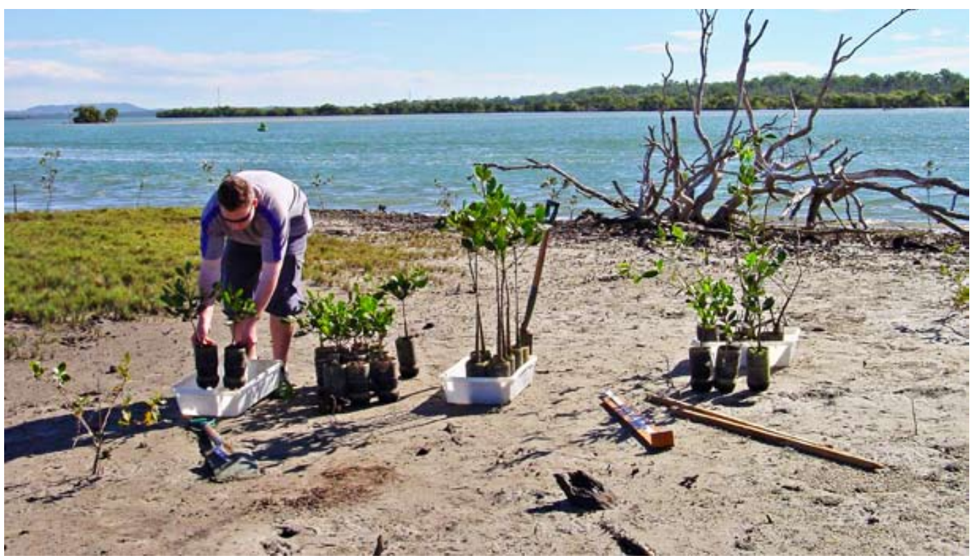
Planting mangroves on a storm-damaged site.

Seedlings are ready for outplanting at the six-leaf (three-