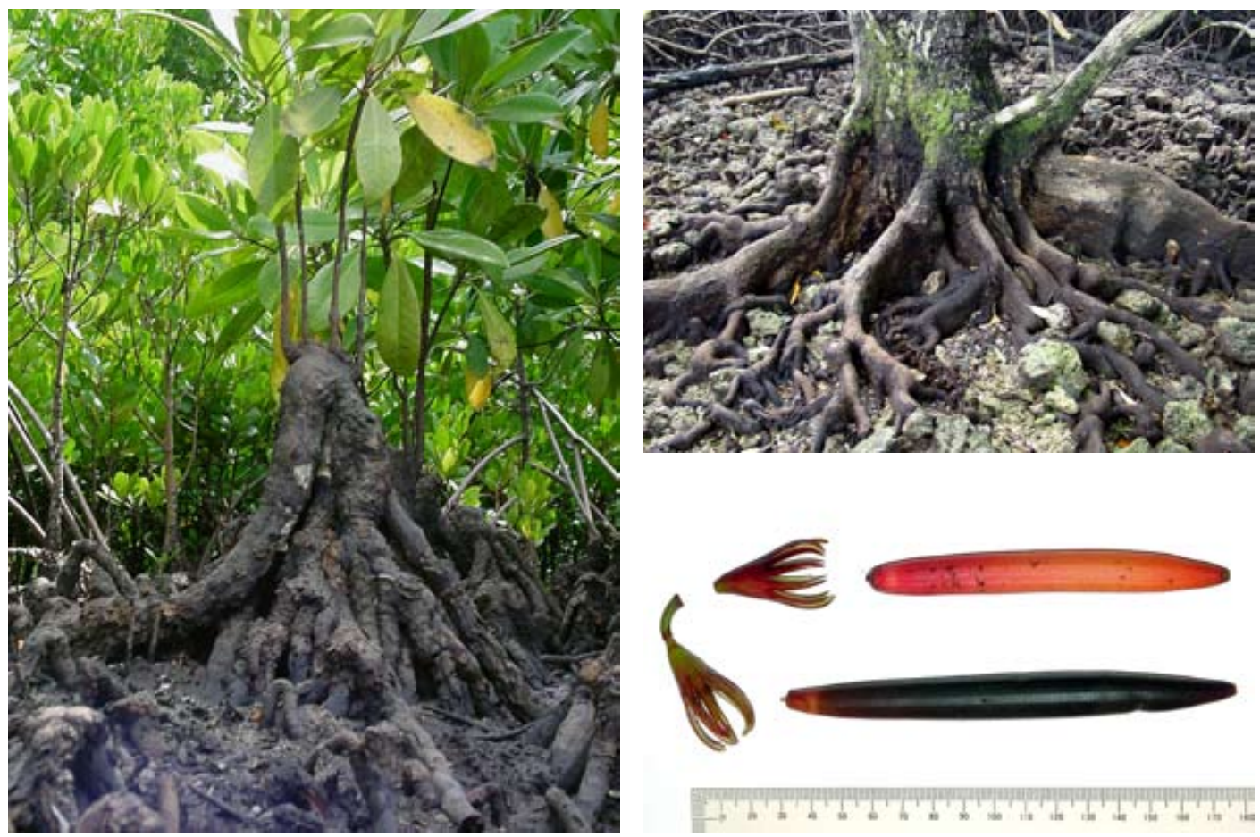
Left: Knee roots with rare instance of sprouting foliage stems. Gazi Bay, Kenya. Top right: Buttress roots and stem base, tree growing on man-made coral rubble platform. Yap, Federated States of Micronesia. Bottom right: Mature hypocotyls comparing a red "albino" form (above) and a normal dark-green form (below). Note also the color variation in calyces, red and redgreen, which is independent of propagule color. Moreton Bay, Queensland, Australia.

per-most. Care must be taken to differentiate between calyx color and petal color, as this may at times be defined as flower color. Red coloration of the calyx is definitely more prevalent in sun-affected locations, within single trees and among trees.