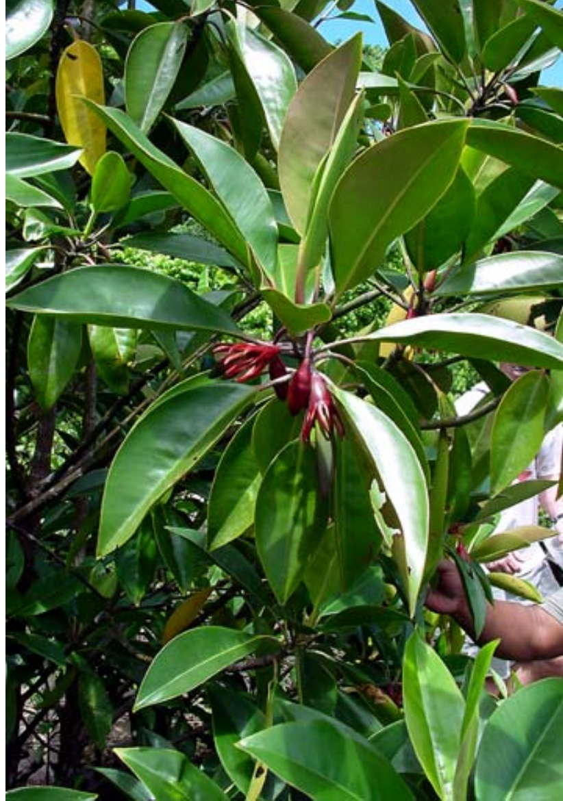
Foliage with flower buds and propagules showing typical red calyx form. Chuuk, Federated States of Micronesia.

Flowers are perfect. Inflorescence has solitary flower buds, located in leaf axils, usually nodding, positioned at the first (or rarely second) node below the apical shoot. Mature flower bud when closed is 3.0–3.5 cm (1.2–1.4 in) long, 1.5–3.5 cm (0.6–1.4 in) wide. Calyx is typically reddish to almost scarlet, occasionally pale yellow, white or green, characteristically smooth or with grooves above lobe junctures, rarely ribbed, with 12–14 lobes, acutely pointed, narrow. Style is pale green, filiform, 3–4 lobes, about 20 mm (0.8 in)