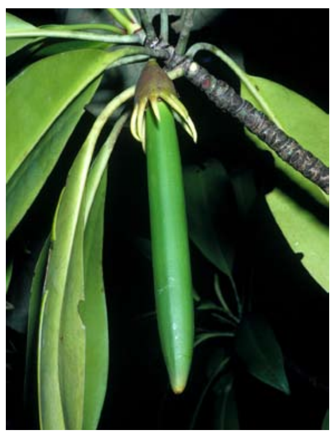
Mature hypocotyl and calyx attached to branch. Daintree River, NE Australia.

Large-leafed mangrove is most likely to be confused with