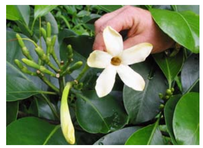
Large-flowered specimen, Ho'omaluhia Gardens, O'ahu, Hawai'i.