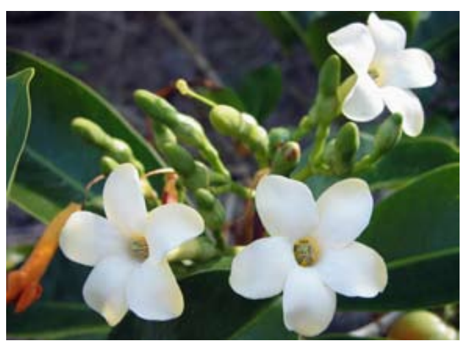
The creamy white, very fragrant flowers make wonderful lei flowers.

The tree is well known as a minor ornamental and lei flower tree. Therein lies its two biggest commercial products: lei flowers and ornamental nursery plants. The flowers were once sold in Hawai'i for making leis. Each flower cost a dime, hence the Hawaiian name pua kenikeni, literally, "dime flower." Coconut oil scented with the flowers is made on locally on some Polynesian islands. Pua kenikeni has a modest commercial potential as an attractive ornamental plant and one planted for its flowers used in leis.