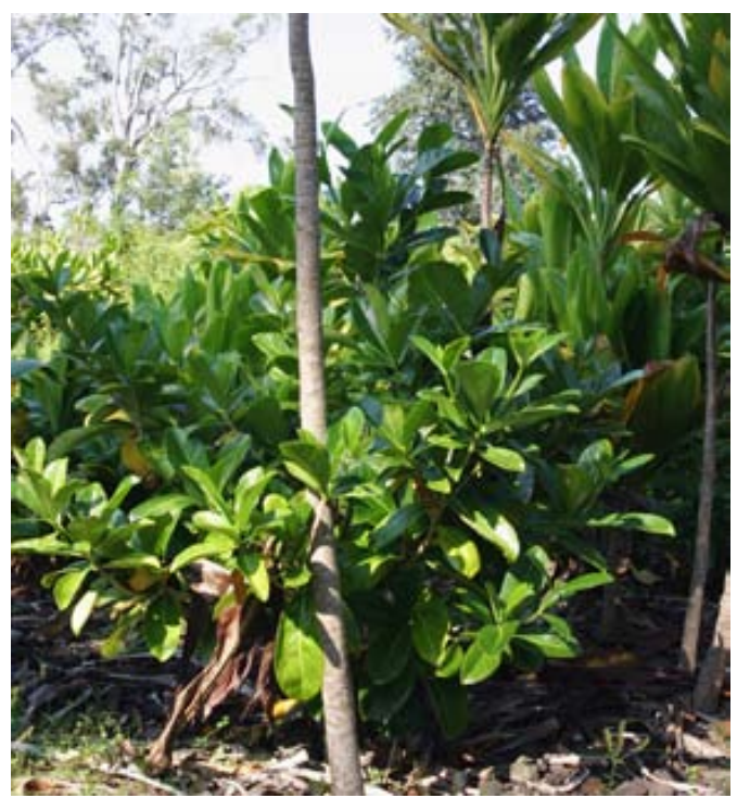
Pua kenikeni growing well under ti (Cordyline fruticosa) plants in South Kona, Hawai'i.

Six trees were planted with 2.5–3 m (8–10 ft) spacing.