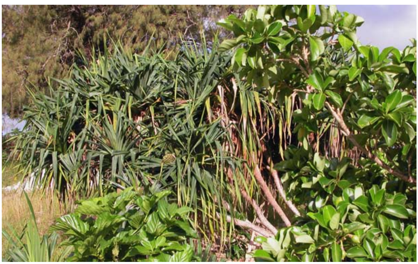
Here grown at a cemetery entrance on Tongatapu together with noni (Morinda citrifolia), screwpine (Pandanus sp.), and in the background, beach she-oak (Casuarina sp.).

The tree is esteemed mostly for its showy flowers and its timber. The flowers are worn singly over the ear or strung