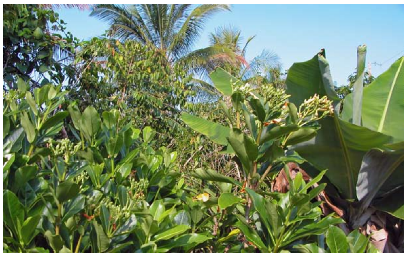
The tree does well in open areas on farms and in homegardens. Here it grows together with coffee, bananas, coconuts, and many other species in North Kona, Hawai'i.

requires free soil drainage. Withholding irrigation water during periods of low rainfall stimulates flowering.