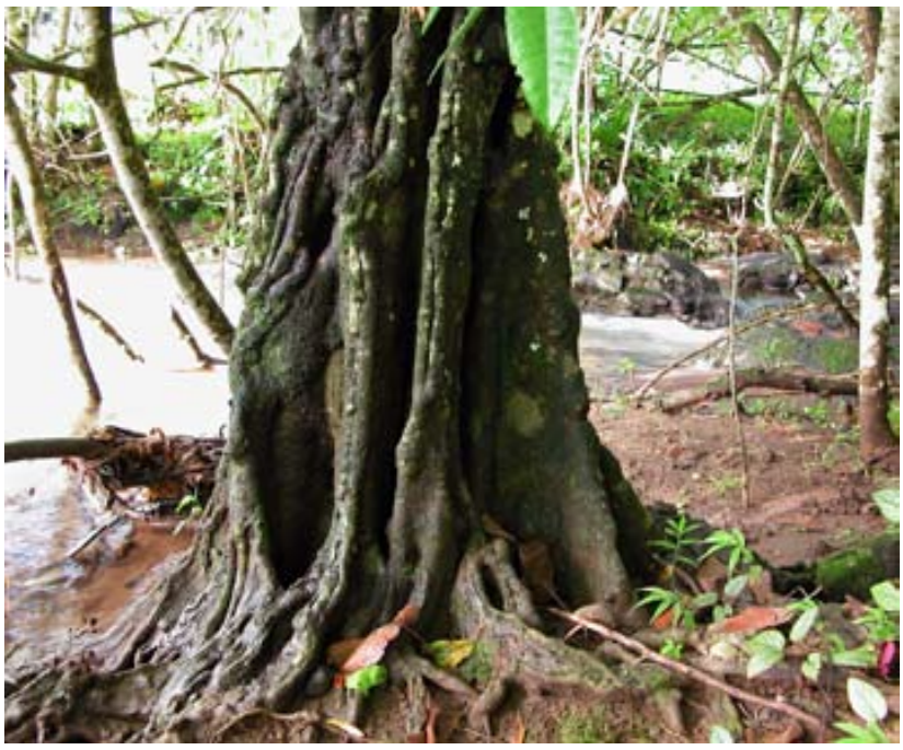
Growth in a swampy area, 'Upolu, Samoa.

Tahitian chestnut is commonly found in areas with full sunlight, although seedlings can grow up through the understory, i.e., in partial shade.