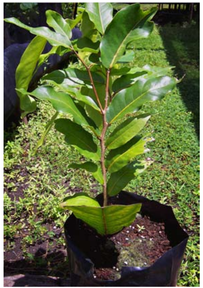
Six month old clone propagated from cutting, Ringgi nursery, Kolombangara, the Solomon Islands.

or sandy loam), which may be sterilized, is also good. Coir must be heated to 100°C (212°F) for 30–45 minutes to prevent potential occurrence of fungal infection, and left overnight to cool down before use. This may be done using a 200 l (55 gal) barrel cut in half lengthwise and placed over a wood fire. During heating, the coir must be turned over thoroughly four or five times to ensure thorough heating throughout.