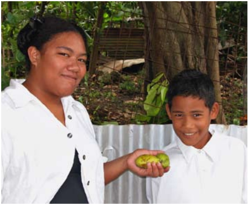
The tree is very suitable for urban areas where people make use of the fruit. Tongatapu, Tonga.

Mulching may be necessary at the early seedling stage. In mature trees, it is not required. Tall and old trees may be pruned to rejuvenate the tree physiologically and encourage new vegetative growth, but fruit production is initially greatly decreased.