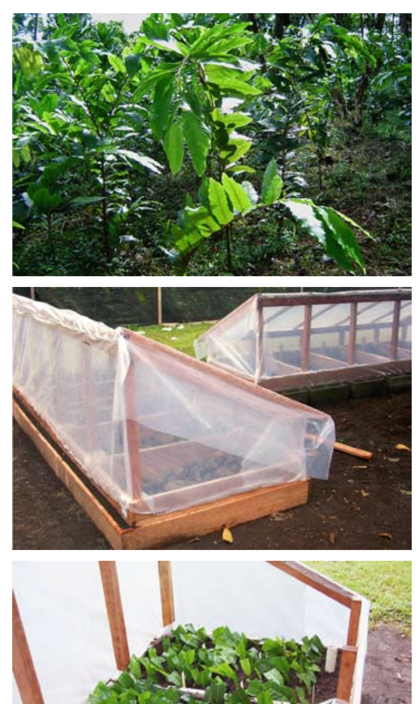
Top down: Multiplication garden of stock plants of selected trees at Ringgi, Kolombangara, Solomon Islands. Poly-propagator system, Ringgi nursery, Kolombangara, Solomon Islands.

Rooted cuttings can be transplanted into I-2 l(I-2 qt) polyethylene nursery bags or other similar containers filled with a potting medium that is well drained, has good water retention capacity, and is light in weight for ease of transport. Coir has proven to be excellent for this purpose, although freely drained garden soil (clay loam