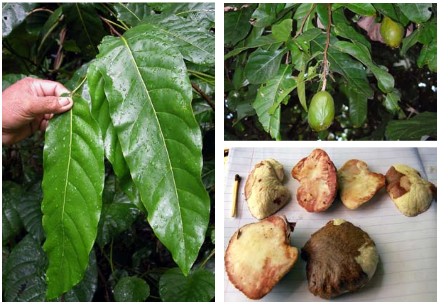
Left and top right: Leaves, fruits on tree, 'Upolu, Samoa. Bottom right: Kernels of varying sizes, Babarego, Choiseul, Solomon Islands.

distributed in its native range. It is commonly found in lowland woody regrowth, edges of old gardens, along rivers and streams, in swamps and marshes, along shorelines, and in coastal locations including mangrove areas and coconut plantations.