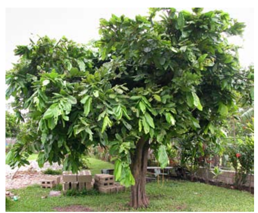
Young tree growing in homegarden, Tongatapu, Tonga.

The tree provides a good wildlife habitat for some nesting bird species. It also provides habitat for red ants ( Oecophylla smaragdina ) that are a biological control of Amplypelta co-cophaga (Hemiptera), a major pest of cocoa in the Solomon Islands.