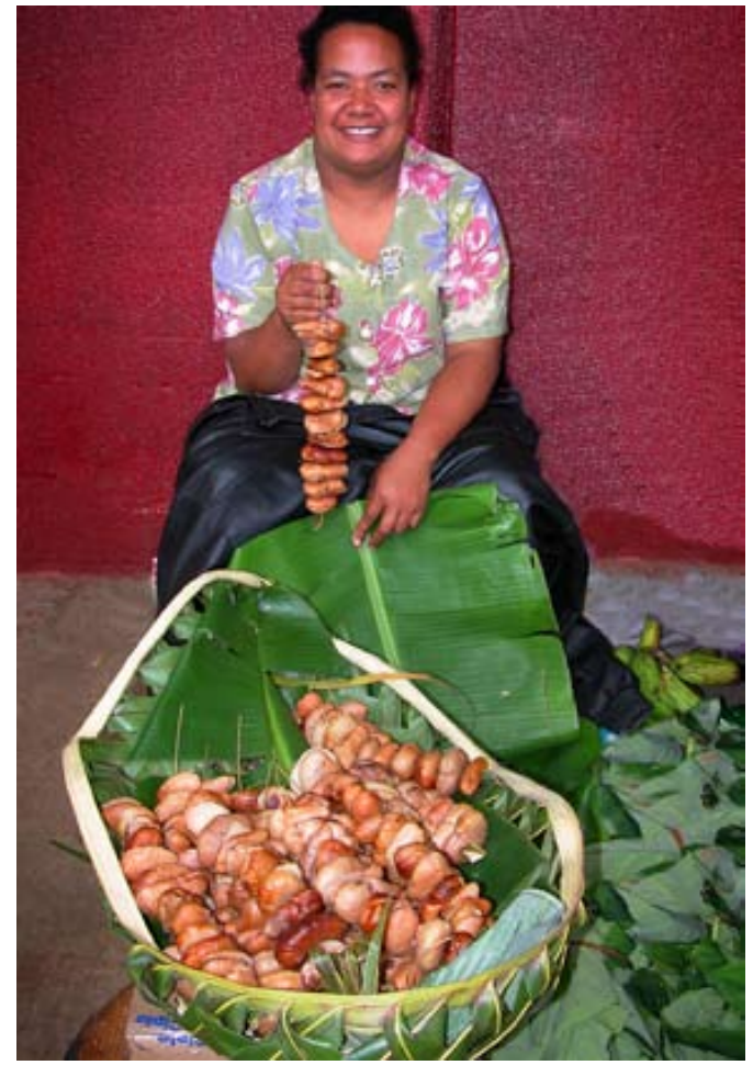
Cooked nuts on skewers for sale at Nuku'alofa market, Tongatapu, Tonga.

The wood is used for carvings and tool handles in Fiji, the Solomon Islands, Vanuatu, and Tonga. The buttress is used in the Reef Islands (Solomon Islands) as a platform for dancing; when placed over a hole it provides a resounding tone.