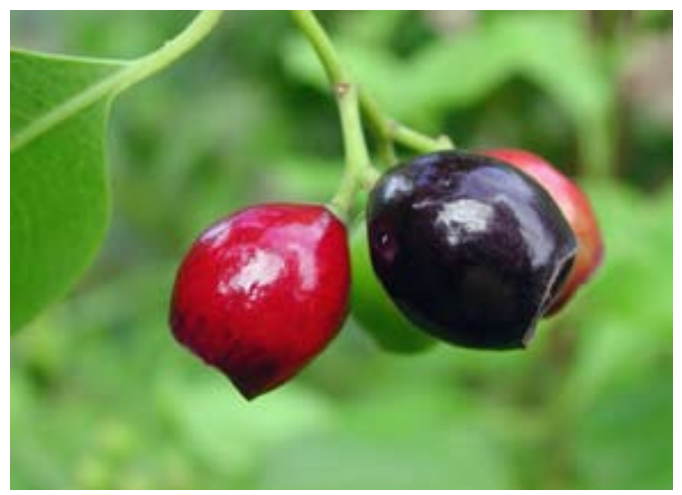
Santalum album fruit.

All species exhibit considerable morphological variation, and numerous traditional varieties are recognized. In the past, taxonomists have divided the extremely variable