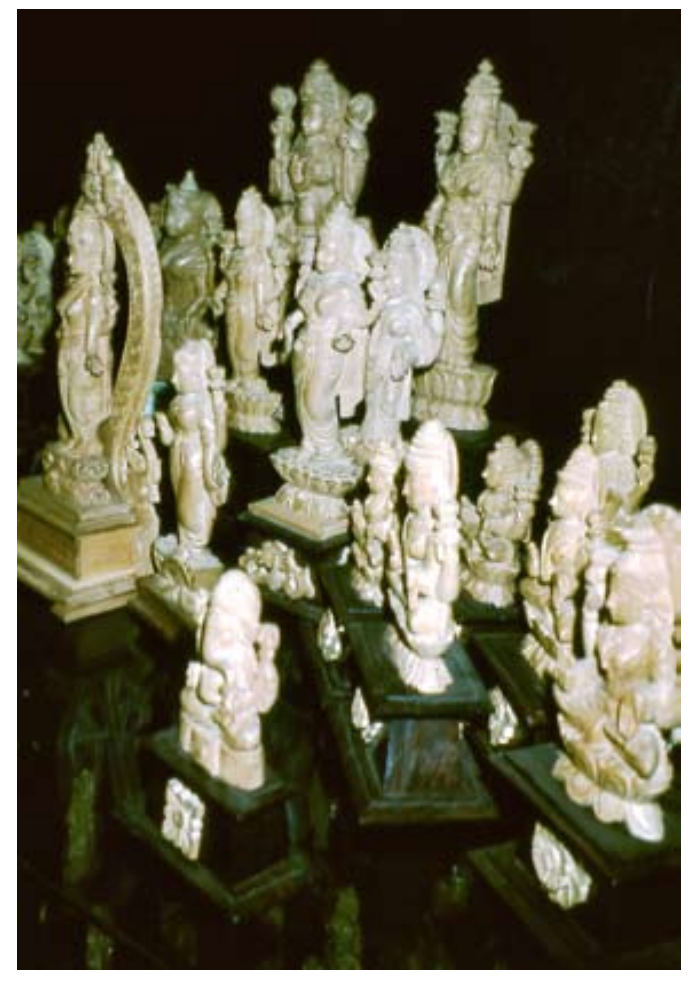
Sandalwood sculptures Bangalore, India.

ing, or wood residue after oil distillation may be used.