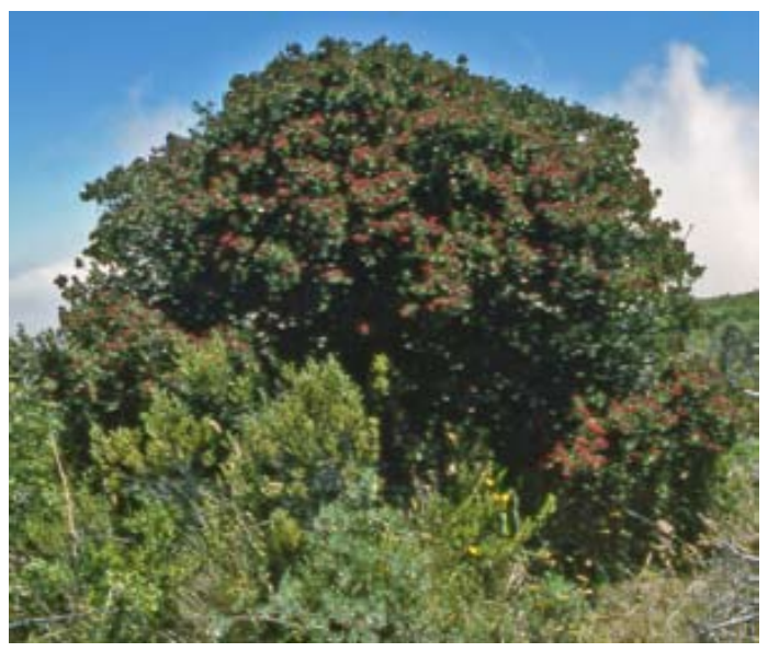
Santalum haleakalae, subalpine region of East Maui.