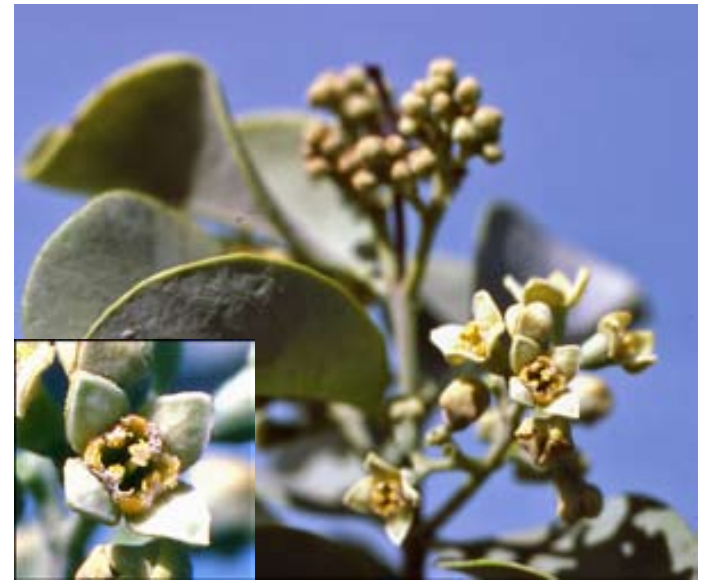
Santalum ellipticum.