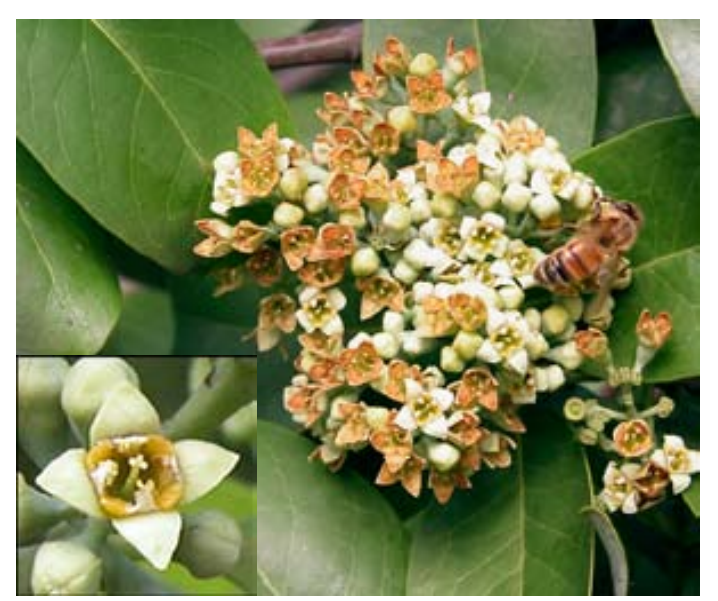
Santalum paniculatum.

Flowers are approximately as long as wide, greenish in bud, and produced in terminal and more or less axillary, compound cymes. The pedicels are about 1 mm long. The floral tube is campanulate to conical. The corolla is 4-8 mm (0.16–0.32 in) long and greenish but tinged with brown, orange, or salmon after opening. The ovary is inferior. Flowers produce a sweet fragrance.