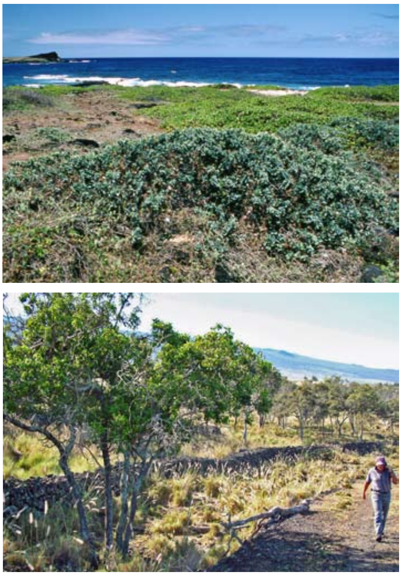
Top: Santalum ellipticum is unique in its adaptation to coastal conditions, here in Makapu'u, O'ahu. Bottom: Santalum ellipticum growing in an upland area in Pu'uwa'awa'a, Hawai'i.

All species are sensitive to fire (and grazing) particularly in the first few years of growth.