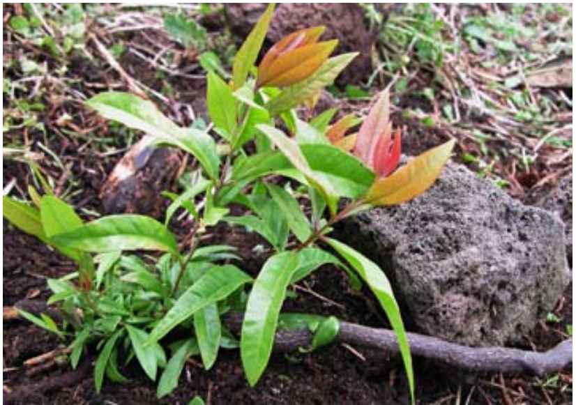
Root shoots of S. paniculatum growing from exposed root.

Hawaiian sandalwood species generally appear to resist most insect attack, although weak infestations of whitefly or scale insects sometimes do occur. Insecticidal soap may be used to treat such pest infestations. Infrequently, a small gray weevil feeds on the young leaves, but usually not to a significantly damaging degree. Some insects such as cockroaches, sow bugs, crickets, and a variety of cutworms may nibble at groundlevel stem parts. Slugs and snails may also feed on newly sprouted plants. To avoid lethal girdling of a seedling, a protective barrier such as a plastic container should be used to protect each newly planted seedling. This is laborious for new plantings of many seedlings but may preclude large losses (Culliney and Koebele 1999).