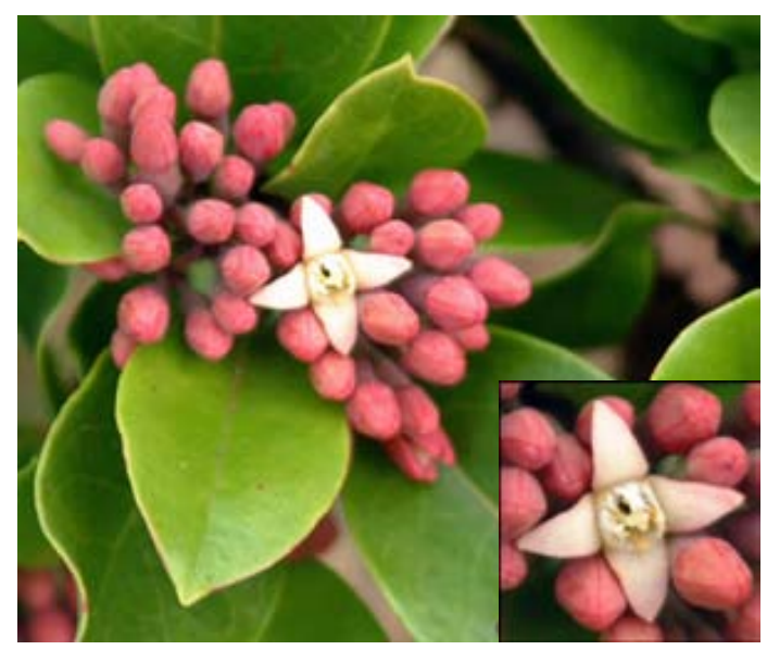
Santalum freycinetianum var. lanaiense.

corolla is 8–17 mm (0.32–0.67 in) long; its outer surface is dark red and glaucous externally, turning to the same color on the inner surface after opening. The ovary is partly inferior. Flowers produce a weak fragrance.