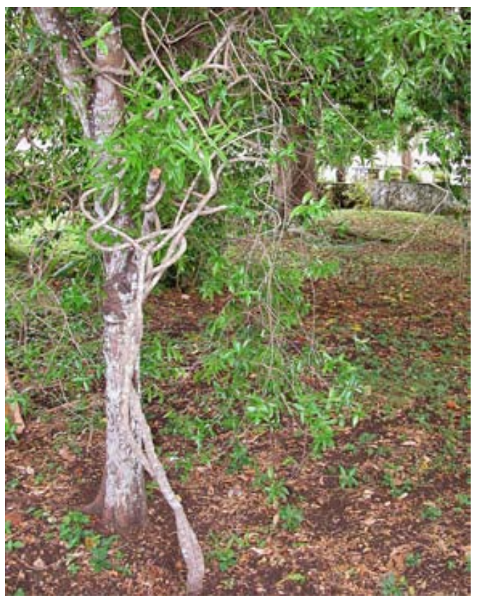
Alyxia stellata, a traditional vine used in leis, climbing on Santalum yasi in a homegarden in Tonga.