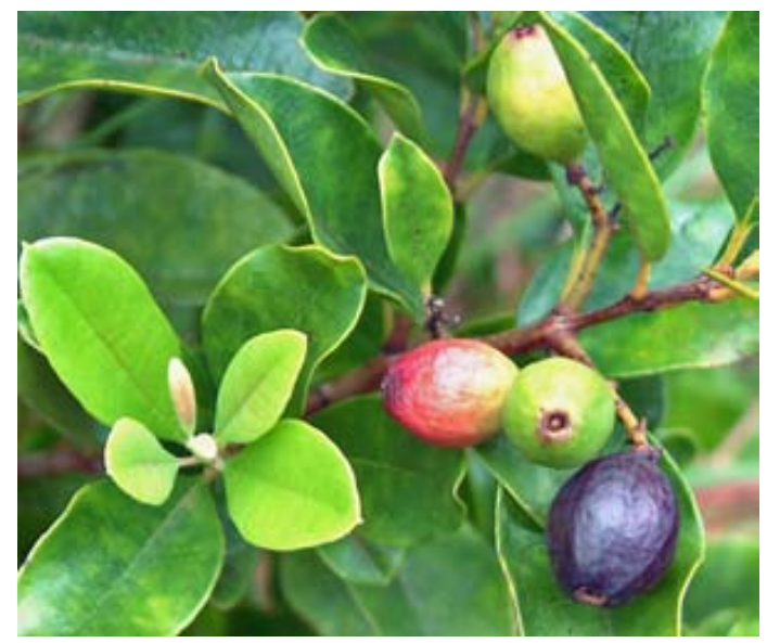
Santalum freycinetianum var. lanaiense.

occasionally a bit glaucous, more or less wilted in appearance, and tinged with purple when immature.