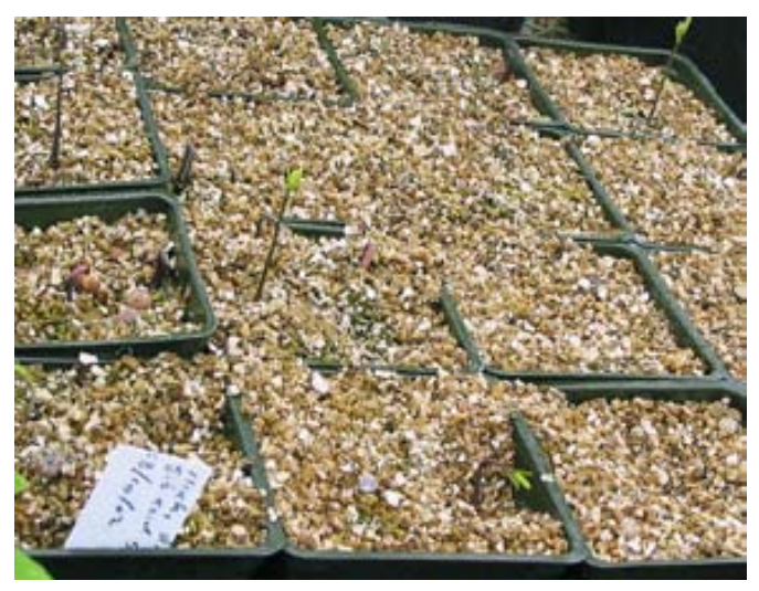
S. paniculatum germinants sprouting in pure vermiculite.

At the two- or four-leaf stage a host plant can be planted together with the seedling (see host table).