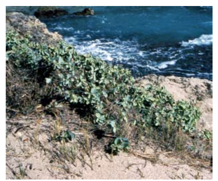
Santalum ellipticum along Wai'anae coast, O'ahu.