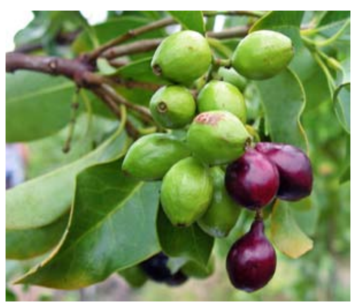
Santalum paniculatum.

is ovate, elliptic, or obovate, and the surfaces have glossy upper sides and dull, sometimes pale, lower sides. Both surfaces are often glaucous, and usually of different colors, occasionally yellowish orange to bluish or olive green.