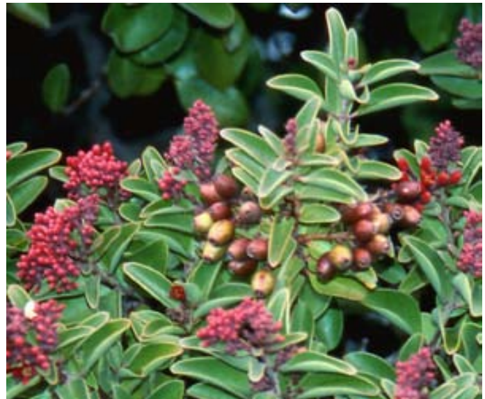
Santalum haleakalae.