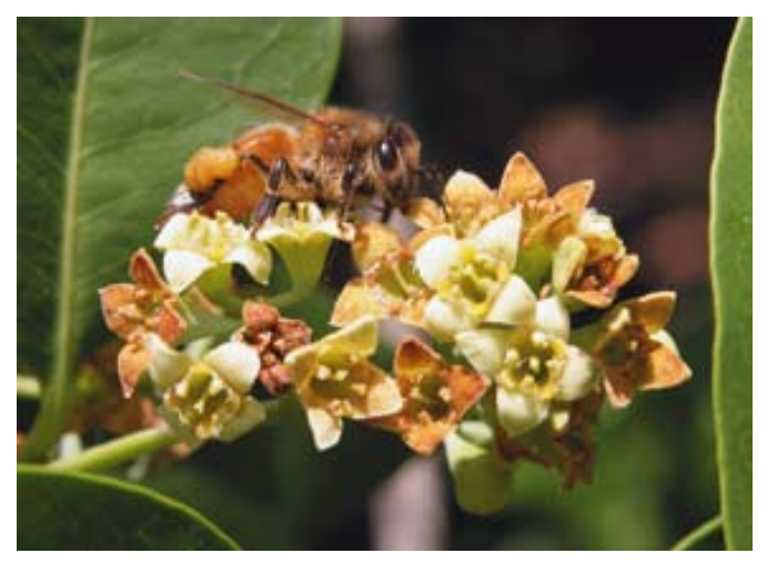
Bees and other pollinators frequent the abundant flowers. S. paniculatum , Kealakekua, Hawai'i.

Sandalwood trees are too slow growing and sensitive to environmental factors to be practical for these uses.