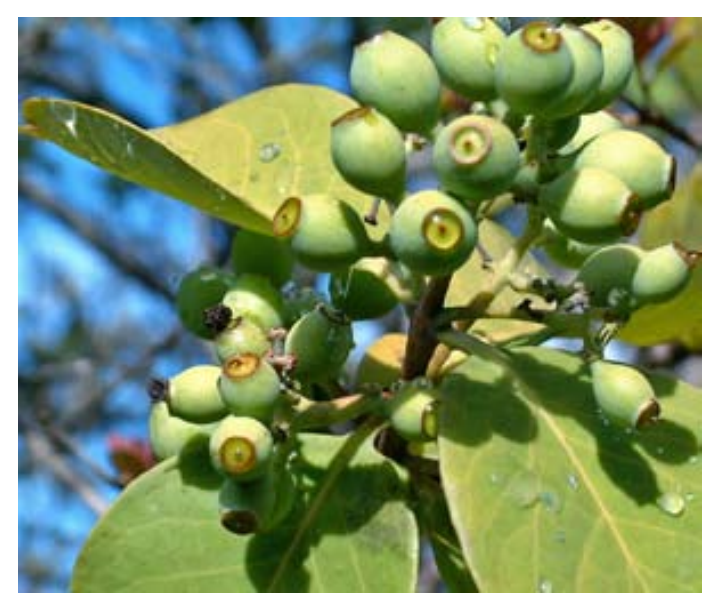
Santalum ellipticum.