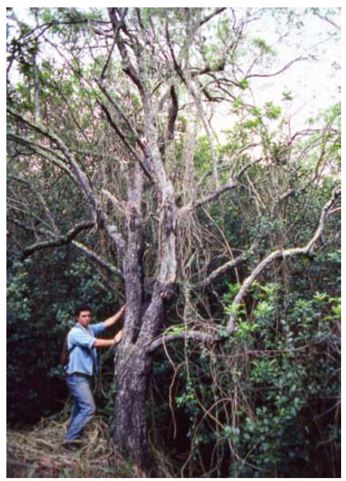
Santalum freycinetianum, southern Wai'anae mountains, O'ahu.