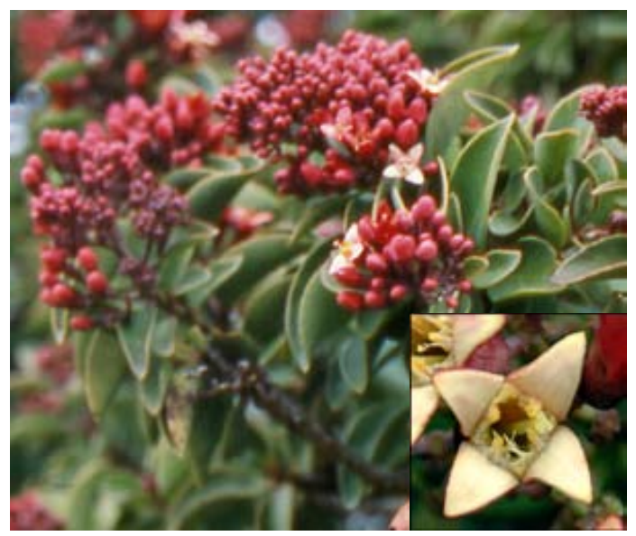
Santalum haleakalae.